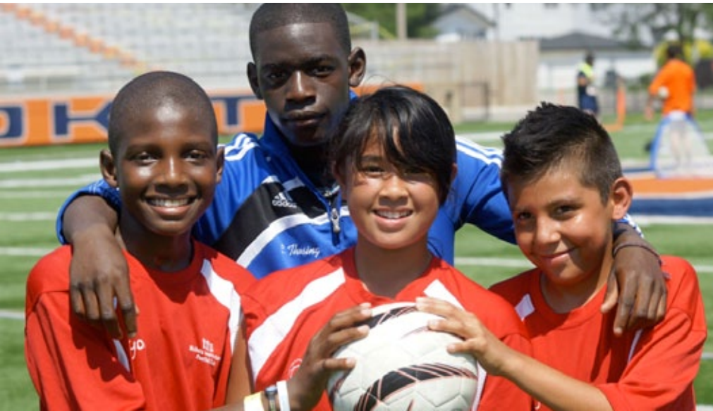
Y.O.U.'s soccer team demonstrated their teamwork during a summer tournament.