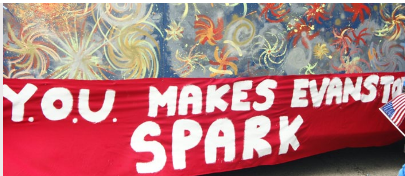
Banner created by Y.O.U. youth for the Fourth of July parade.

In January, Y.O.U.'s Nichols Service Learning Group received the first-ever McGaw YMCA Talley-Reece Award for its environmental awareness project.