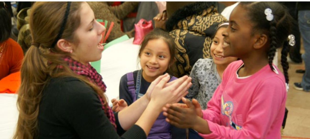
Staff leading youth during winter Family Night.

100% have decreased anti-social behavior.